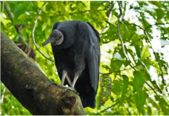
Gallinazo Gallinazo Negro Black Vulture Coragyps atratus Vuela alto, come carroñera, y le falta sentido del olfato Flies high, feeds on roadkill, and has no sense of smell