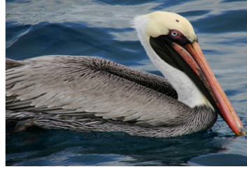
Patillo o Alcatraz Pelicano Pardo Brown Pelican Pelecanus occidentalis Navega con las olas, y se sumergen para pescar Navigates using waves, and feeds on fish by plunge diving