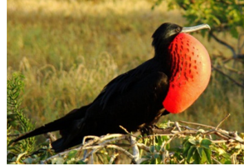
Tijeras Fragata Magnifica Magnificent Frigate Bird Fregata magnificens Infla su bolsa gular roja para atraer una pareja Inflates red gular sac in order to attract a male