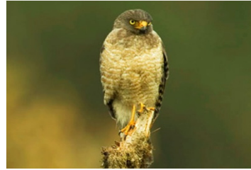
Gavilán Gavilán Campestre Roadside Hawk Buteo magnirostris Se percha a los lados de los caminos y las calles Often seen perched on roadsides