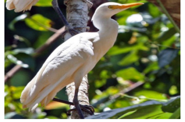
Garza Garceta Bueyera Cattle Egret Bubulcus ibis Come insectos perturbados por ganado Eats insects flushed by grazing cattle