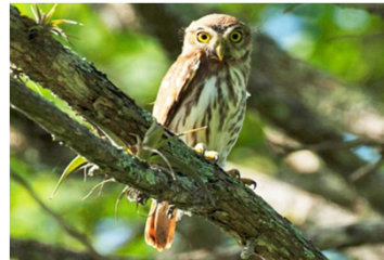
Búho o Lechuza Mochuelo del Pacífico Pacific Pygmy-Owl Glaucidium peruanum Nocturnos: canto una repetición rápida de "pew pew pew" Nocturnal: song of rapidly repeating "pew pew" notes