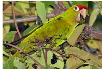
Cachete Rojo o Lorito Perico Caretirrojo Red Masked Parakeet Aratinga erythrogenys Casi amenazado, tráfico para mascotas Near threatened status due to pet trade traffic