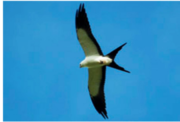
Tijereta Elanio Tijereta Swallow-tailed Kite Elanoides forficatus Cola larga como tijeras: vuela alto y graciosamente Long, forked tail; flies gracefully high above canopy