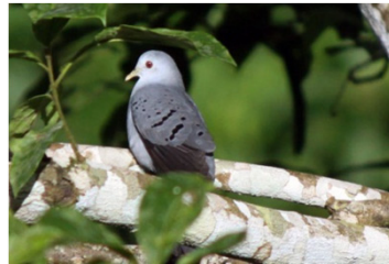
Paloma o Frijolera Tortolita Azul Blue Ground-dove Claravis pretiosa Característico ruido de aleteo de paloma Wingbeats make characteristic fluttering, pumping sound