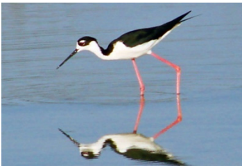
Cuello Negro Cigüeñuela Cuellinegra Black-necked Stilt Himantopus mexicanus Busca comida en charcos y lugares lodosos Probes in ponds and mud for food