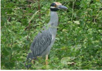
Guaco Martinete Coronado Yellow-crowned Night-Heron Nyctanassa violacea Nocturno: caza crustáceos a las orillas de agua Nocturnal: hunts crustaceans along shorelines