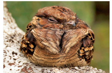
Chotacabras Pauraque Pauraque Nyctidromus albicollis Nocturnos: hace saltos del suelo con ruido como burbujas Nocturnal: flushes from the ground making popping noise