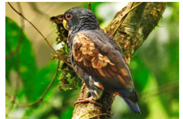
Guauera Loro Alibronceado Bronze-winged Parrot Pionus chalcopterus Vuelan en grupos, y se perchan en árboles muertos Fly in groups, and perch on dead snags