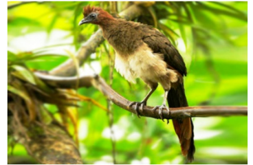
Guacharaca Chachalaca Cabecirrufo Rufous-headed Chachalaca Ortalis erythroptera Grande como un pavo, y en grupos: muy ruidosa Large, turkey-sized bird found in groups; very noisy